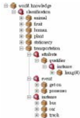
Figure 2. An instance of world knowledge