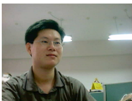
Fig. 4. Finding the person's facial image.

In face detection system, the Sobel mask is applied on the given image the system retrieves an appropriate edge image and the Hough transform is applied to find the location of face image (Fig. 4). Thus, the facial image is captured shown in Fig. 5.