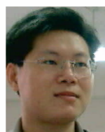
Fig. 5. The captured facial image.

Secondly, we can perform face verification and the captured facial image is compared with the images in the database.