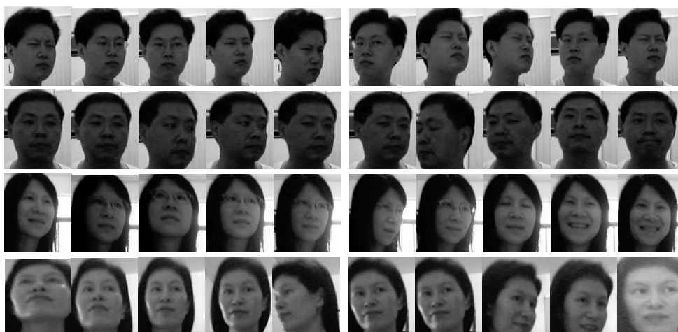
Fig. 6. The face image databases.