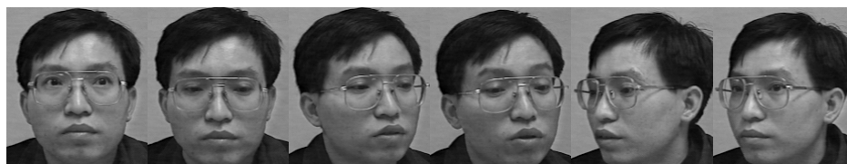
Fig. 2. Sample face images in the IIS database.

In this section, there are two databases used to evaluate the performance of the proposed method. The Database 1 is the ORL database and the Database 2 is the IIS database [10]. They are well-known public domain face databases. The ORL database contains 40 subjects and 400 images. The IIS database contains 100 subjects and 3,000 images. Examples of typical face images from the IIS database are shown in Fig. 2. The experimental platform is the AMD K7 Athlon 2GHz processor, 512M DDRAM, Windows XP, and the software is Matlab 6.1.